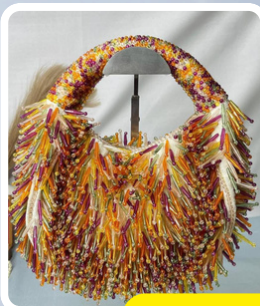
BAG & ACCESSORIES