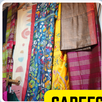
SAREES & KURTIS